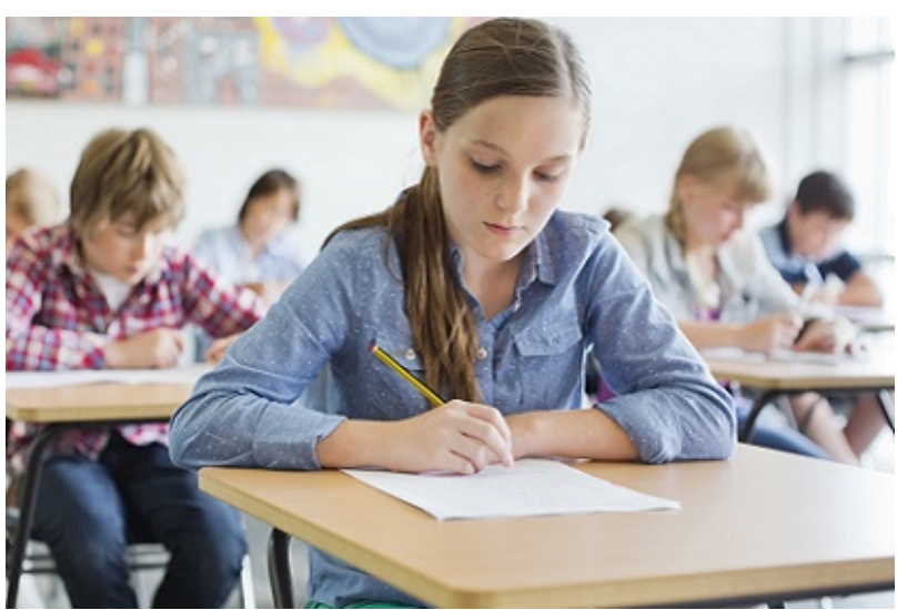
New coverage reports expanding mental health resources for kids.

MADISON, Wis. — In case you missed it, Governor Tony Evers stood with students, teachers, parents, and mental health professionals at schools across Wisconsin this week to <u>deliver</u> $15 million in funding that will be used to expand mental health resources in nearly every school district.