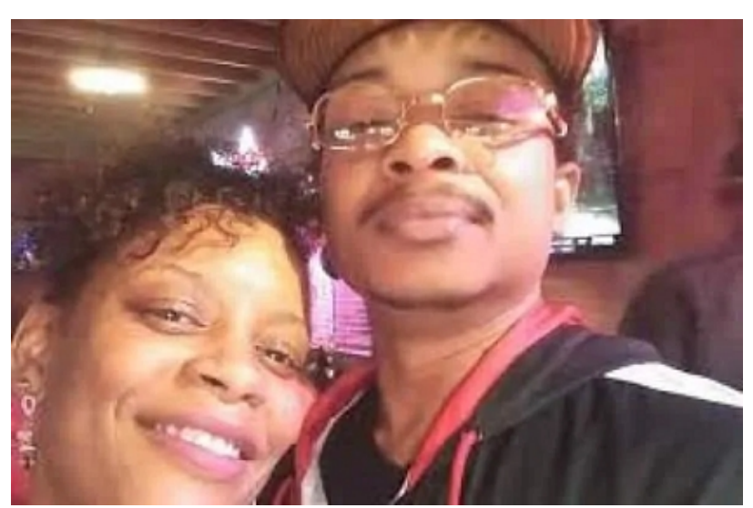
Candidate for Senate comments on the one year anniversary of Kenosha police shooting.