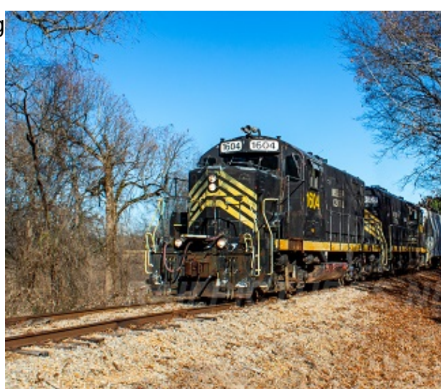
Arntzen, a private firm, will use the new 1,100-foot rail spur to receive deliveries of steel plate which is the primary raw material for their production of pipes.

http://newiprogressive.com/images/stories/S5/railroad-s5.jpg