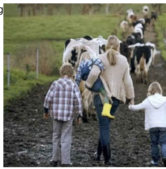
We ensure farmers, farm families, and rural communities have access to mental and behavioral health services that meaningfully address the unique personal and professional challenges they face, says Gov. Evers.

http://newiprogressive.com/images/stories/S5/farm-family-s450.jpg