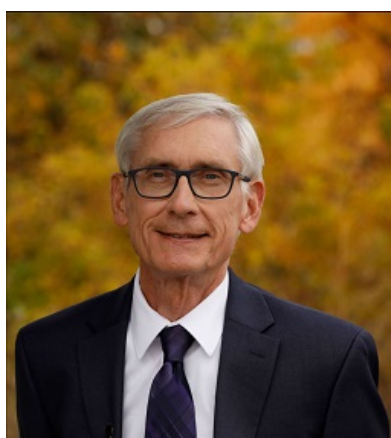
"Every Wisconsinite should have access to the quality, affordable healthcare they need when they need it, especially our kids who have been struggling perhaps now more than ever," said

Children's Wisconsin will use $5 million of the investment to enhance youth mental health services and support a new pediatric psychology residency program. The remaining more than $9 million will be administered by the University of Wisconsin-Whitewater (UW-Whitewater) to help bolster Wisconsin's mental health and substance use services workforce.