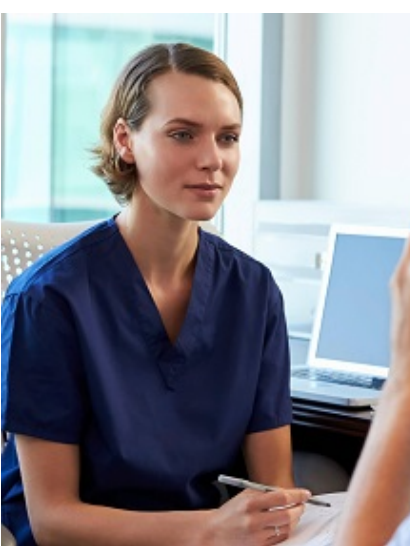
Projects to increase access and build workforce for mental health and substance use services

http://newiprogressive.com/images/stories/S5/behavioral-health-2-s450.jpg