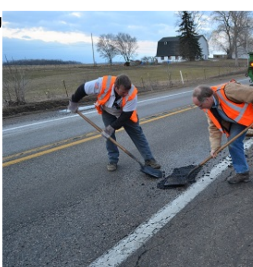
Gov. Evers, DOT Secretary-designee Thompson to make three stops across the state to discuss governor's biennial budget proposal.

http://newiprogressive.com/images/stories/S5/road-potholes-s5.jpg