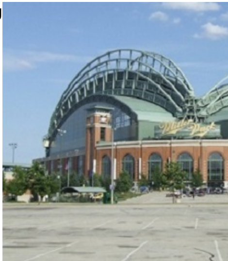
Plan saves thousands of family-supporting jobs while ensuring a new generation of Wisconsinites can grow up cheering for the home team.

http://newiprogressive.com/images/stories/S5/miller-park-milw-s451.jpg