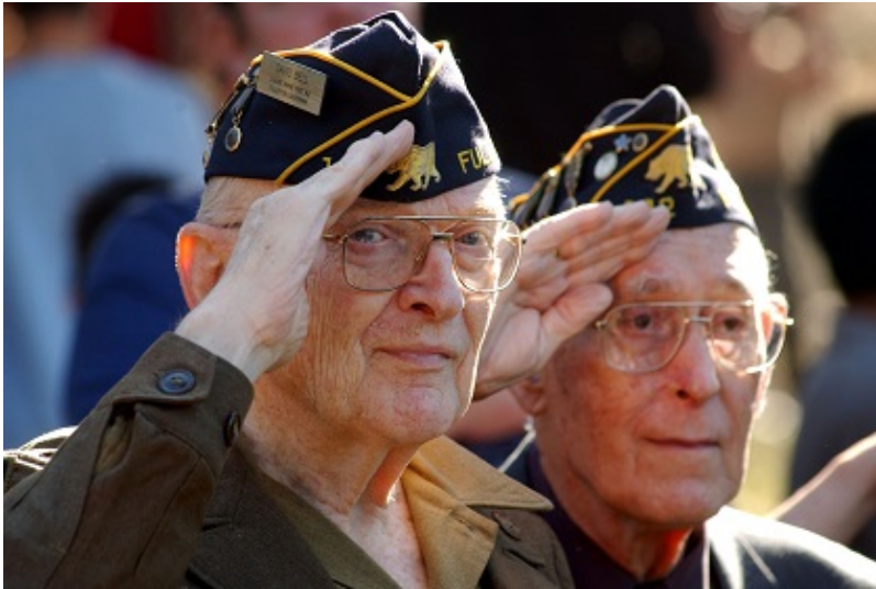
Hero lost his life during World War II.

Written by GOV Press Wisconsin Friday, 30 June 2023 10:53 -