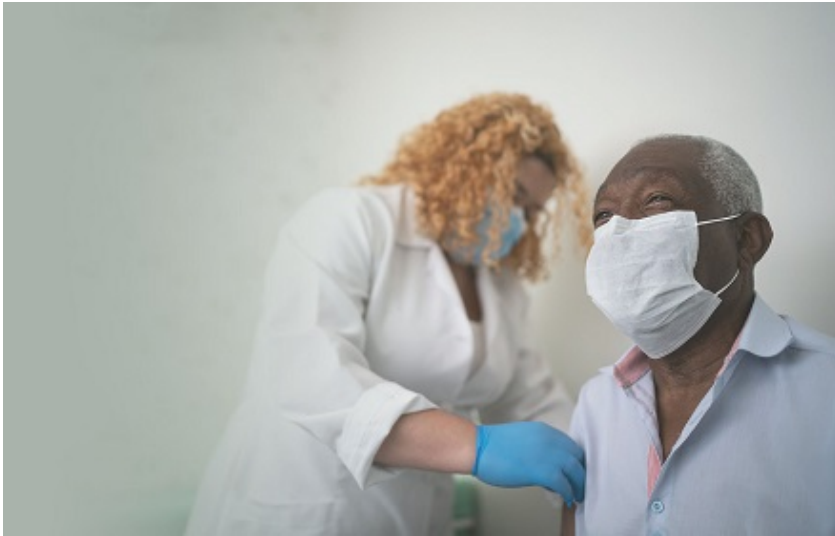
Fourth DHS community-based vaccination clinic to open

Friday, 26 March 2021 07:55 - Last Updated Saturday, 27 March 2021 08:05