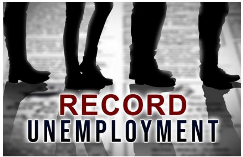
Bills would roll back barriers to Unemployment Insurance (UI) imposed during decade of misguided anti-worker legislation.

Posted on Jul 17, Posted by <u>Jon Erpenbach Press. State Senator 27th District</u> Category <u>Wisconsin</u>